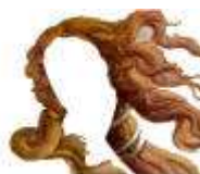
brown hair brunette