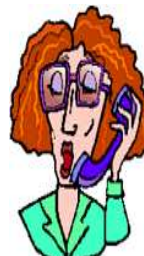
She has medium length hair.