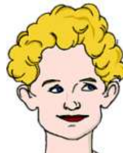
She is white. She has very pale skin.” *