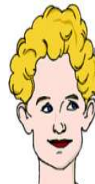
She has short hair.