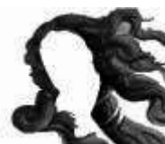
black hair -