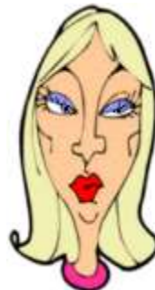
She is white. She has lightly tanned skin.