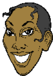
She is black. She has dark skin.