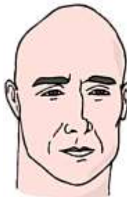
He is white. He has fair skin.