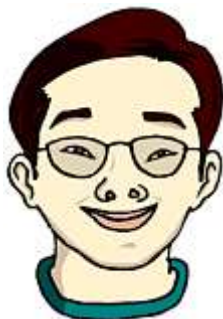
He is asian. He has light-brown skin.