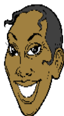
She has short hair.