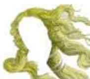
blonde/fair hair blonde