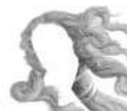
grey hair -