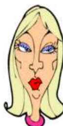
She has medium length hair.