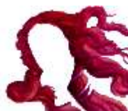
red hair redhead